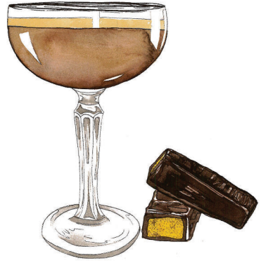
• SALTED CARAMEL ESPRESSO MARTINI •