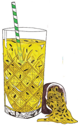
• FROSTY FRUIT •