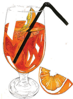
• APEROL SPRITZ •