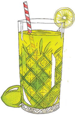
• NAUGHTY TIMES •