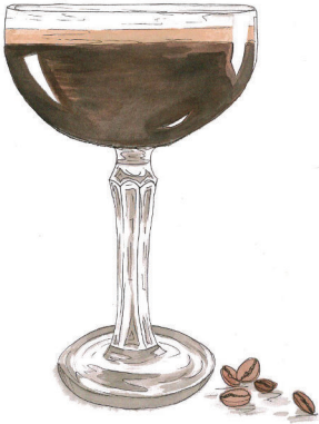
• ESPRESSO MARTINI •