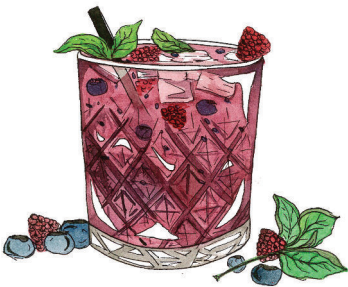
• BERRY SMASH •